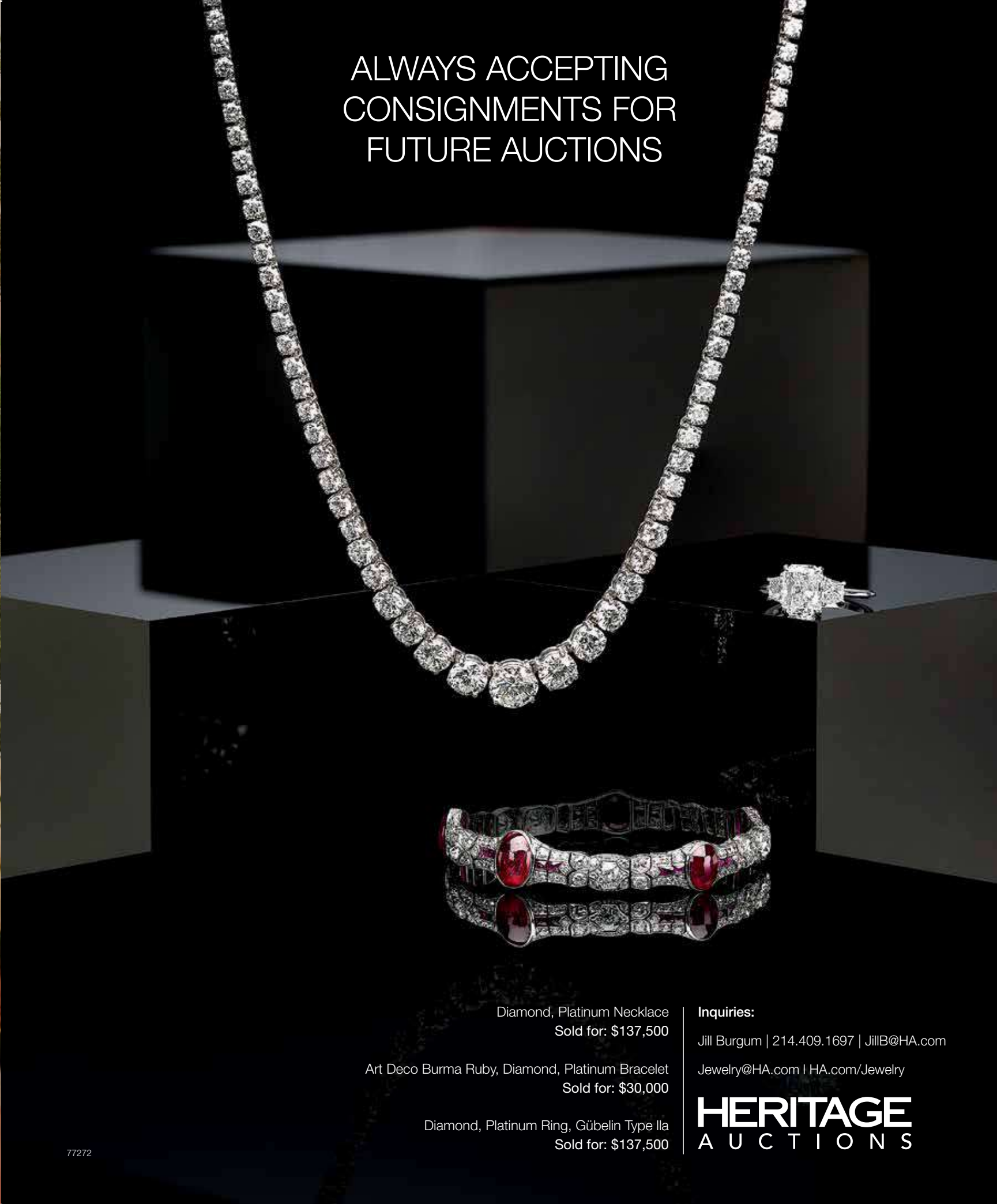
Diamond, Platinum Necklace Sold for: $137,500

ALWAYS ACCEPTING CONSIGNMENTS FOR FUTURE AUCTIONS